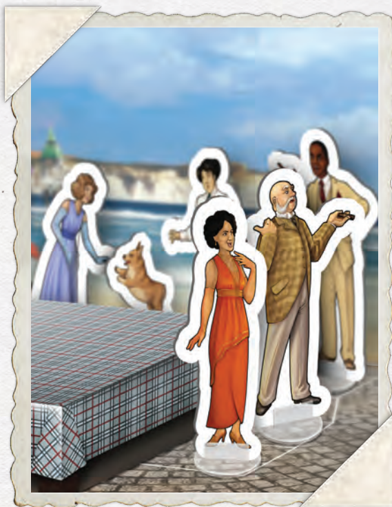
This could be your photo.